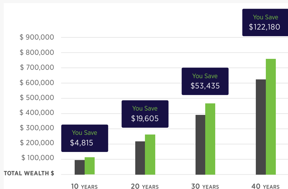
Illustrative Impact of Fee Savings on $30,000 Investment with Justwealth 1

Wealth with Mutual Fund Potential Wealth with Justwealth